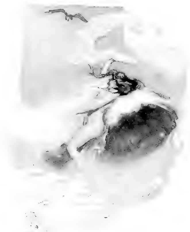
"THE GODDESS THERE IN HER OWN HANDS RECEIVED IT."—Page 296.